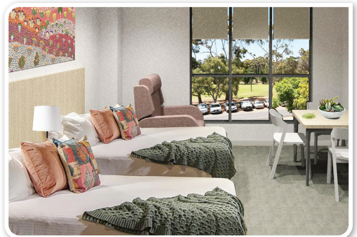
An artist's impression of one of the new room types.

"It's not just the shock of the diagnosis, it's also not knowing how long you'll be away from home. When you live 800 kms away, you can't just 'slip home' for the weekend. Greenhill Lodge has everything—you can cook in the kitchen, get takeaway, get the bus to treatment. Without it I'd have been lost." – Kym, Lodge guest.